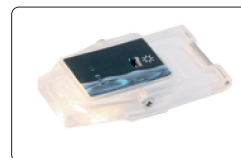
lighting cover plate (optional)