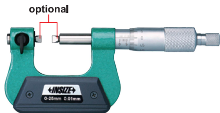
3281-25A (measuring tips are optional)