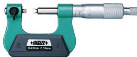
3281-S25 (measuring tips are included)